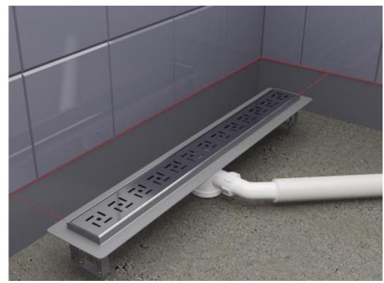
2. Connect the channel to the drainage system and set the height using the adjustable legs so that the upper edge of the frame is approximately 1mm below the