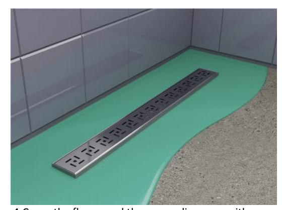
4. Cover the flange and the surrouding area with an insulating foil in a liquid form.