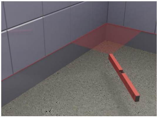
1. Set the level of the finished shower floor surface and mark it on the wall in the area where the channel will be fitted(allow for the slope of the shower surface)