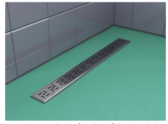
6. Apply a second coat of the liquid foil to the whole surface of the shower area and the sealing membrane.

7. Once the liquid foil is completely dry as per the manufacturer's instructions, the shower surface can be tiled(eg ceramic tiles or granite). Seal the gap between the tiles and the channel frame with flexible sanitary silicone compatible with the tile and grout colour.