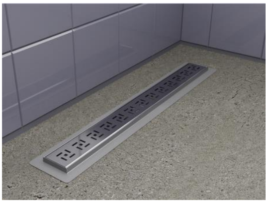
3. Fill the space under and around the channel with screed or a similar product to the level of the flange.